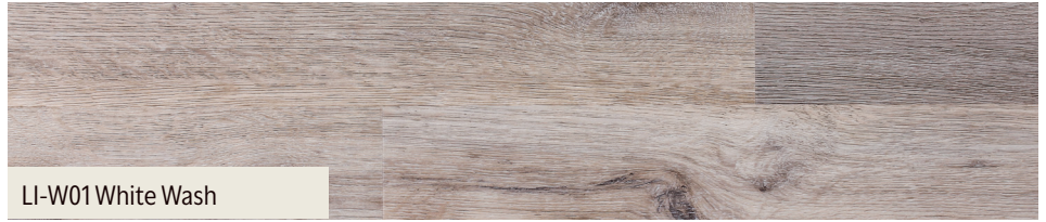
LI-W01 White Wash