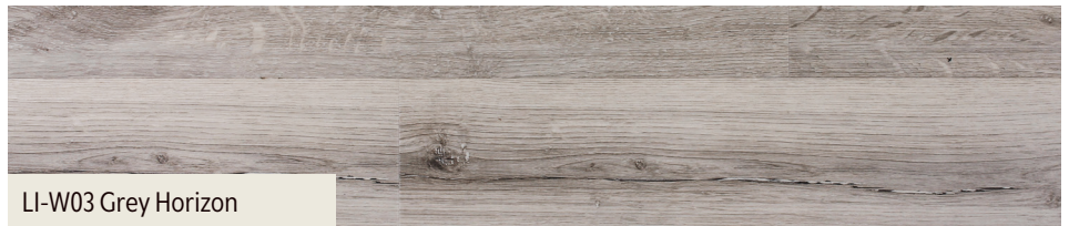
LI-W03 Grey Horizon