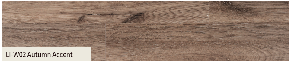
LI-W02 Autumn Accent