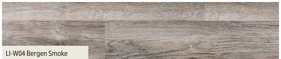
LI-W04 Bergen Smoke