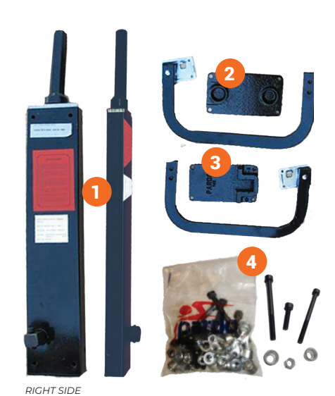
Mechanisms are handed.